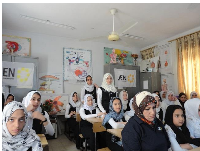
Above: Students of Al Etemad Intermediate Girls School.

Did you know that during the 1970s and 1980s Iraq had one of the best education systems in the Middle East? Unfortunately, the Gulf War and Iraq War deteriorated the education system and left very little budget allocated for bettering the schools. It is important that the children receive proper education in a safe environment. For this reason, JEN's projects on renovation school facilities and promoting hygiene education gives hope to the Iraqis.