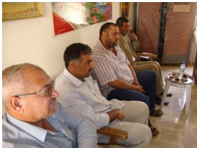
Above: Parents attend a meeting to discuss the school.

The parents were also very happy with the improvement in their children's health and hygiene awareness. One parent said, "The school's latrines were so dysfunctional before, and now that they are so clean, my child says that she likes the toilet facility at her school better than the one in our home." Many parents expressed their appreciation for JEN for providing cleaning materials and hygiene kits to the school because it is apparent that they have succeeded in raising awareness for hygiene.