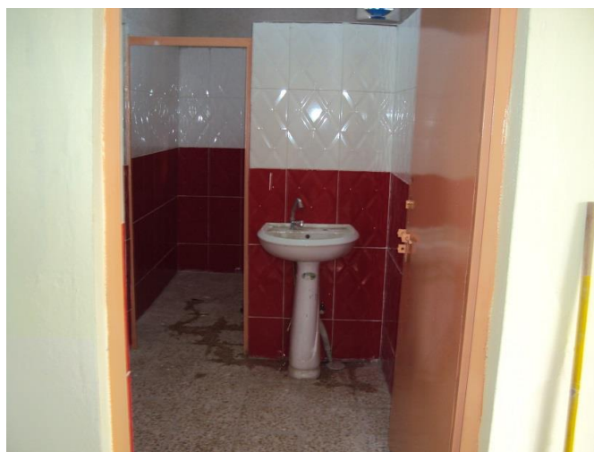
Above: A newly renovated bathroom facility in the Om Salama Intermediate School for Girls.

Because of the situation, the headmaster did not believe that JEN would renovate the school. When JEN completed the project, which included fixing the electrical network system, latrine, door, and roof, the headmaster was very grateful.