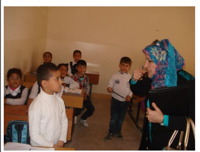
<u>Above</u>: A teacher shows her student how to properly brush his teeth.

The monitoring survey takes place after a facility has been renovated to assess the completion of a project. JEN uses these surveys to continue creating effective and impactful projects.