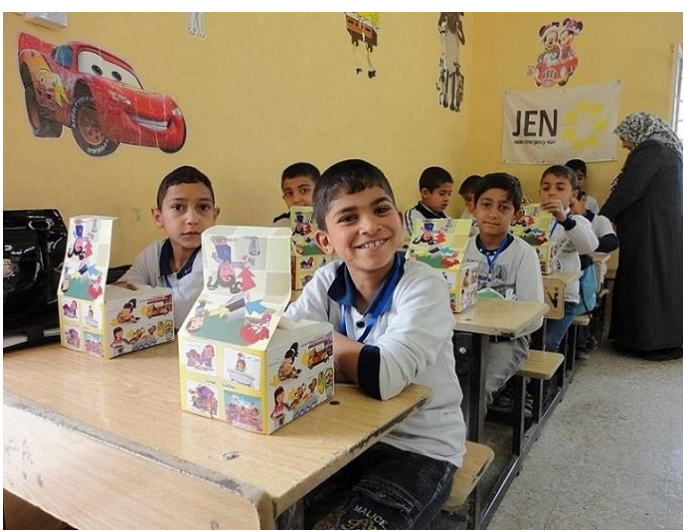
<u>Above</u>: Students with their portable trash boxes, which JEN developed with the Ministry of Education in Irag.

A twelfth grade student from one the school's JEN renovated expressed his sincere gratitude towards JEN. He stated that some students used to go the bathroom outside in soiled areas because the school's restroom facilities were squalid, and now that they are newly renovated, he would like to work with JEN to keep his school clean.