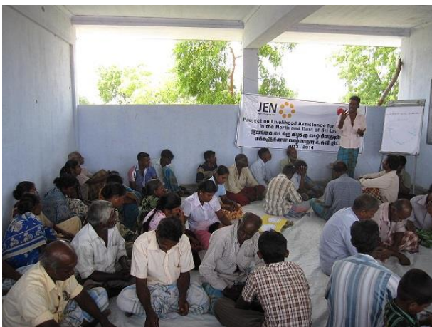
Above: Participants at JEN's agricultural workshop

In Eastern Sri Lanka, JEN is not only providing support through the construction of wells, but also through agricultural workshops – supported by the Agricultural Department – in order to empower and enforce individual productivity, in addition to garnering confidence among farmers.