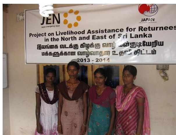
Above: Local community workers from Mullaitivu

In September, the JEN field staff paid a visit to an ongoing project in the Mullaitivu district, located in the north-eastern coast of Sri Lanka. The current construction is funded by Japan's Ministry of Foreign Affairs, and consists of the construction of agro-wells as well as workshops to impart community members on how to maintain and share their water resources.