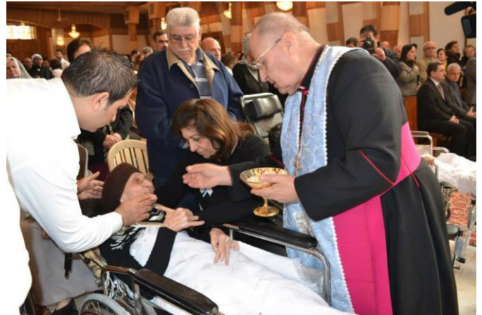
Above: A patient from the Bethany House with his family and a member of the church.

International Patients Day, which began on May 13, 1992 by Pope John Paul II to pray for patients, was celebrated in Baghdad this year. Their message at this year's event was "faith and love." Many churches in Iraq celebrated the day this year to pray and hold events to support the patients psychologically and financially.