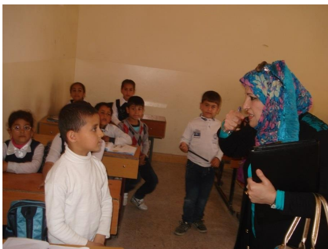
Above: A teacher shows her student how to properly brush his teeth.

The monitoring survey takes place after a facility has been renovated to assess the completion of a project. JEN uses these surveys to continue creating effective and impactful projects.