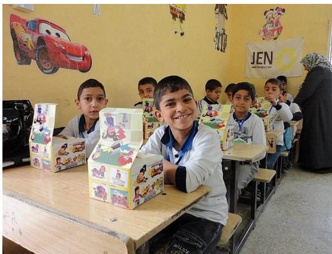
Above: Students with their portable trash boxes, which JEN developed with the Ministry of Education in Iraq.

A twelfth grade student from one the school's JEN renovated expressed his sincere gratitude towards JEN. He stated that some students used to go the bathroom outside in soiled areas because the school's restroom facilities were squalid, and now that they are newly renovated, he would like to work with JEN to keep his school clean.